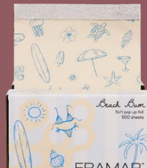
beach bum 5x11 pop-up foil 500pc