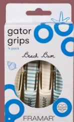
beach bum gator grips