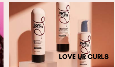
LOVE UR CURLS