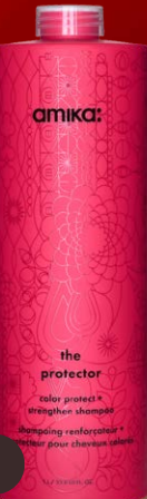
THE PROTECTOR shampoo 1000ml