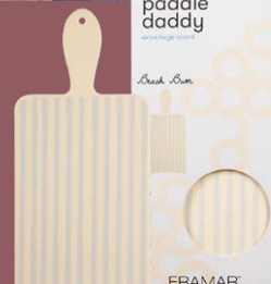
beach bum paddle daddy