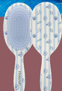
beach bum detangling brush