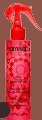
THE PROTECTOR color protect + strengthen treatment 200ml