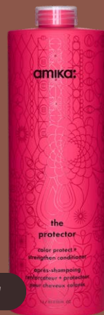
THE PROTECTOR conditioner 1000ml