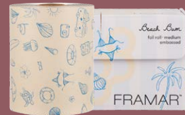
beach bum medium embossed foil roll 320ft